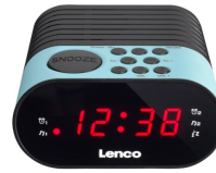
Lenco CR-07 FM Alarm Clock Radio with With Sleep Timer