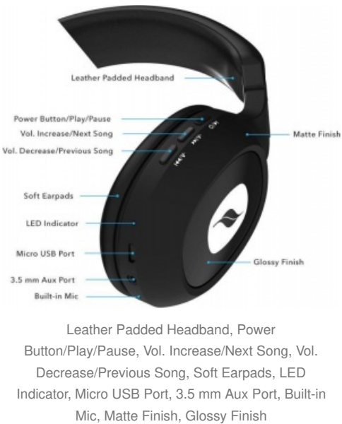
Leather Padded Headband, Power Button/Play/Pause, Vol. Increase/Next Song, Vol. Decrease/Previous Song, Soft Earpads, LED Indicator, Micro USB Port, 3.5 mm Aux Port, Built-in Mic, Matte Finish, Glossy Finish