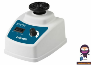
Labnet S0200 Vortex Mixer