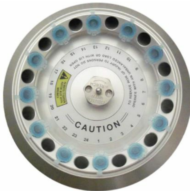
Figure 1. Loading the rotor to achieve balance.