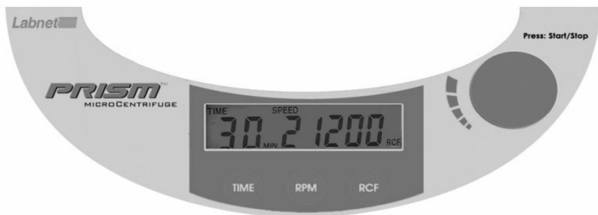
Figure 2. Labnet Prism™ microcentrifuge control panel layout.

The speed (rpm or g-force) can be selected from 500 to 15,000 rpm in 100 rpm increments or from 100 to 21,200 x g with the control knob. The speed is selected by pressing the RPM or RCF button. The speed signal will begin to blink. Then, turn the control knob to increase or decrease the value.