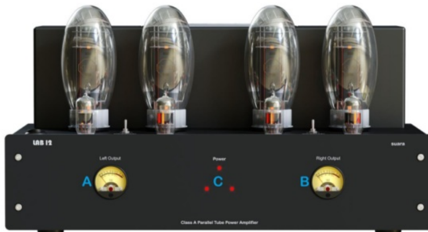
Suara Front panel

In the front panel you will see three indication LEDs and two VU meters.