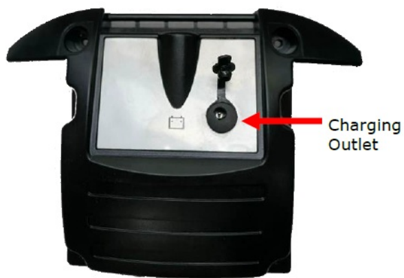
Battery Charger Charging