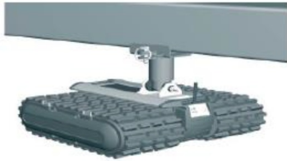
Illustration of the Robot Trolley mounted on the side members of the caravan:

VARIANTS CT2500 is equipped with a tall or low tower with ball joint CT2500 Tall tower Height is adjustable CT2500 Low tower