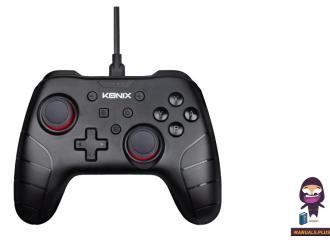
KONIX 3879 Gaming Controller Black USB Gamepad