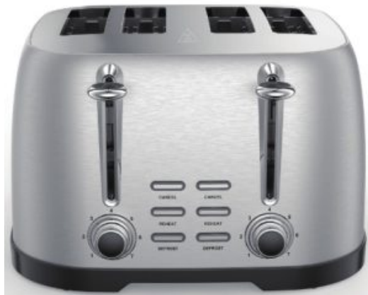
Kogan 4 Slice Toaster (Silver) KA4SLTOASTB