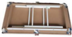
Pool table board A x 1pc