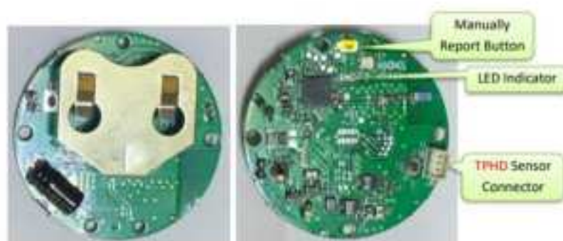
Figure 1 Relative Temperature and Humidity (TPHD) Sensor

The following photos show the BLE sensors and BLE gateway PCBAs.