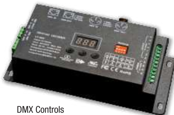
DMX Controls BY OTHERS