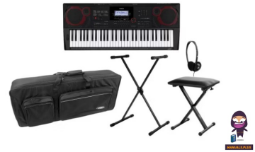
KIRSTEIN Casio CT-X3000 MIDI Keyboard Set