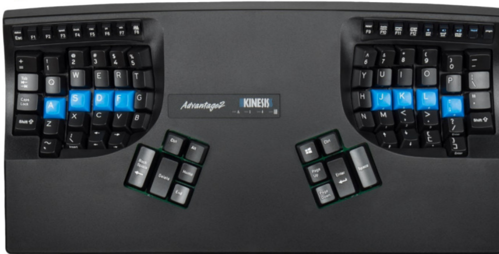
Fig 1. KB600

No special software or drivers are needed. The Advantage2 is plug-and-play with all operating systems that support full-featured USB keyboards.*