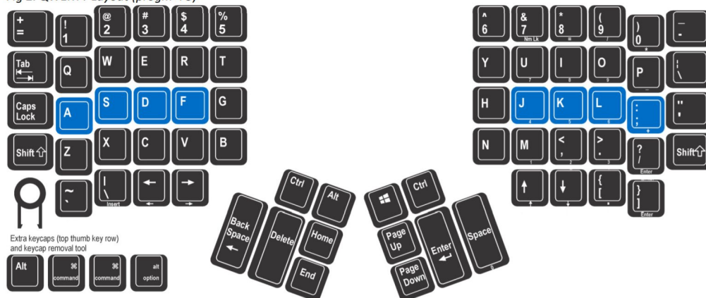
Fig 2. QWERTY Layout (prog+F3)

All Advantage2 keyboards come pre-configured from the factory with the familiar QWERTY layout, but creating custom QWERTY Layouts is easy with the simple Onboard Programming Tools (see next page).