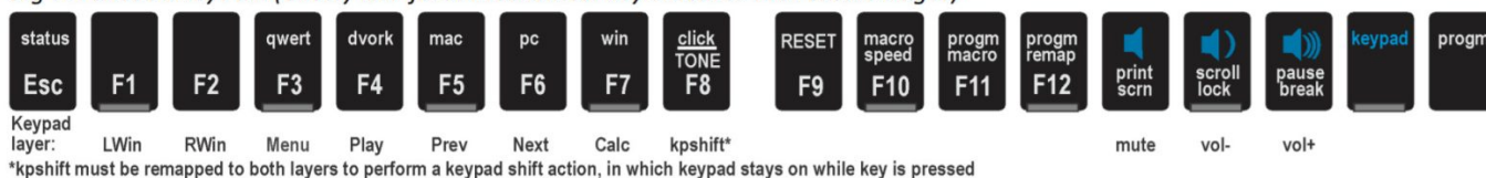
Fig 7. Function key row (Cherry low-force mechanical key switches with tactile ridges)

Note: Actions legend in lower case require only the Program Key to activate, whereas actions legend in CAPS require the Program Key plus Shift Key to activate.