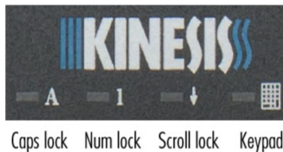
Fig 11. Keyboard LEDs

The blue LEDs located near the center of the keyboard indicate the status of the keyboard. The LEDs will illuminate when each of the four basic modes is active (see Fig 11). These LEDs also flash during SmartSet programming actions (slow or fast) to indicate the keyboard's temporary programming status.