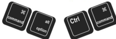
Fig 5. Mac Mode: prog+F5