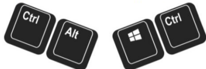
Fig 4. Windows Mode: prog+F4