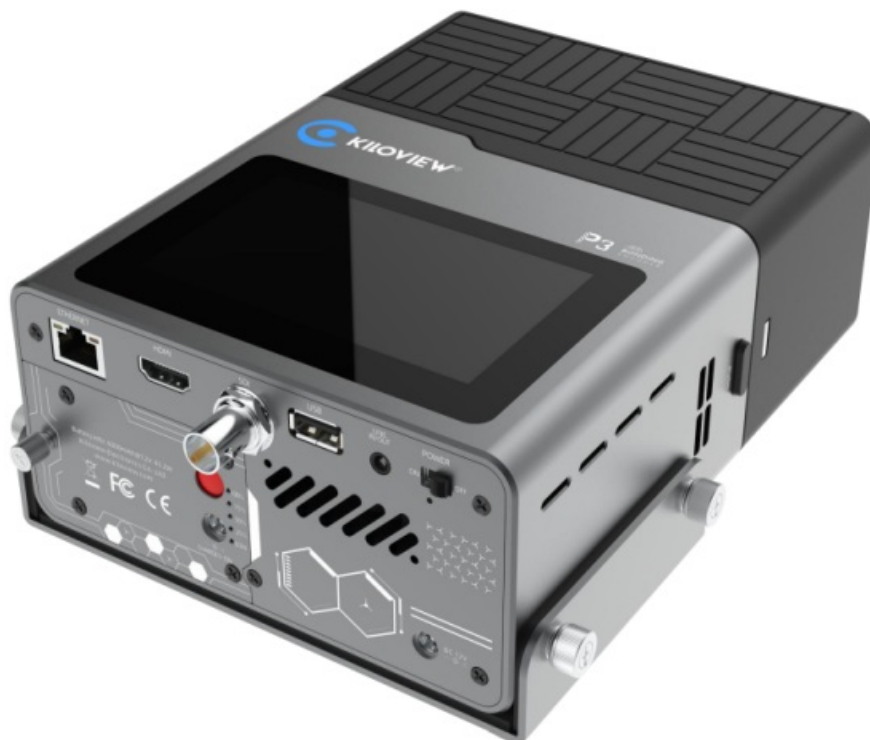
P3 Wireless Bonding Encoder

P3 is a new generation wireless aggregate encoder created by Kiloview based on KiloLink transmission technology. P3 supports simultaneous multi-channel wireless aggregation connections: WIFI (2.4G/5G dual-band), Ethernet; the dual-battery module has a total capacity of 6000mAh @7.2V 43.2W, and can last for more than 4 hours without changing the battery. It also supports uninterrupted power supply and battery replacement for all-day