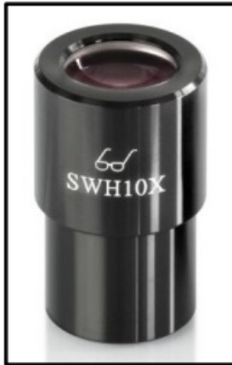
High Eye Point eyepiece (identified by the glasses symbol)