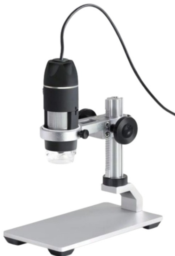
KERN ODC-89 ODC 895 Version 1.3 09/2023