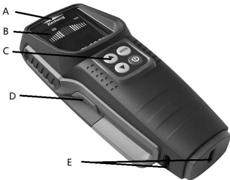
Illustration of display screen