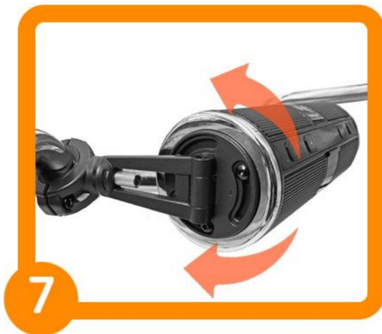
Reorientation of the host