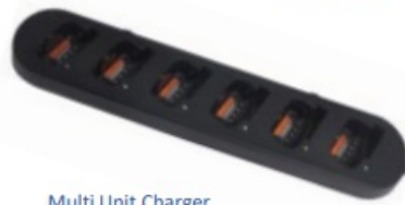
Multi Unit Charger w/ power supply