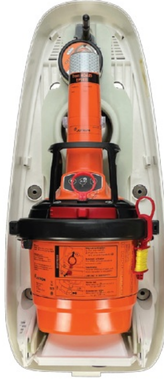
Tron 40AIS with float-free bracket

The Tron 40AIS is available with a float-free heating bracket. This EPIRB has been tested for operational and performance requirements in accordance with the international standard, IEC 61097-2 Ed.4 (April 2021), making it both the most modern and innovative EPIRB available.