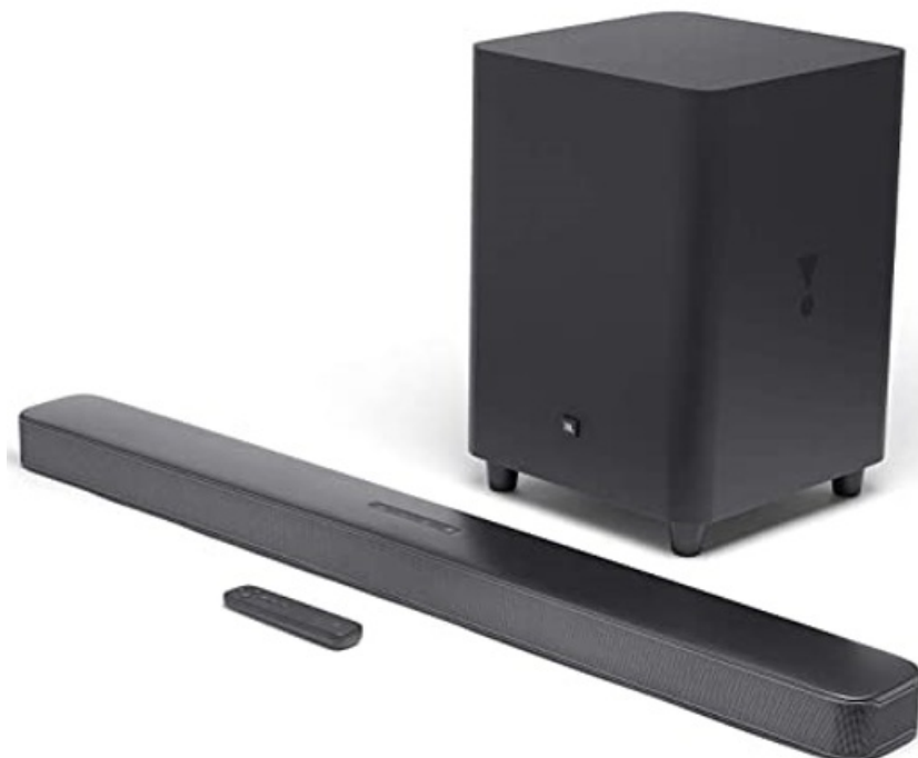
JBL Bar 5.1 Surround

Bar 5.1 Surround Software Release Notes Owner's Manual