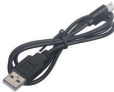
USB Power Cable