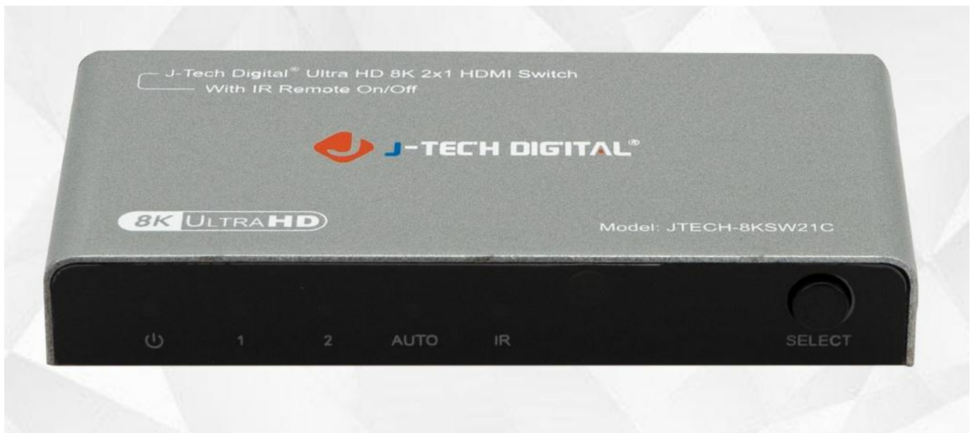
Ultra HD 8K 2x1 HDMI Switch JTD-3003 | JTECH-8KSW21C