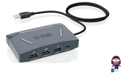
IOGEAR IOGEAR GE1337P2 KeyMander 2 Keyboard Mouse Adapter