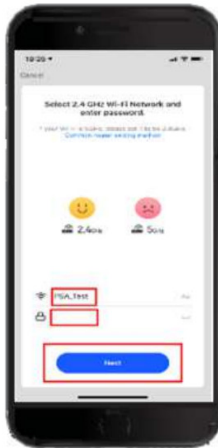
Figure 5. WiFi Login

h. Tap “Next” to save the Wi-Fi setting.