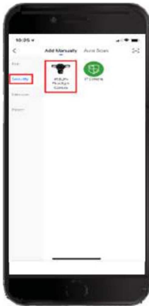
Figure 3. Select Product

d. Confirm the default “EZ Mode” is shown on top right of App screen. Otherwise tap it to change to “EZ Mode”. (Figure 4)