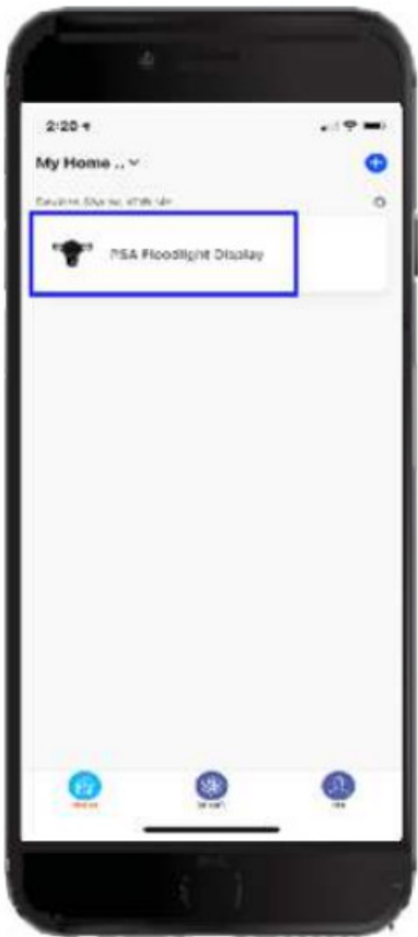
Version 2.0 July 2023

TIP: If requested, tap to accept sharing.