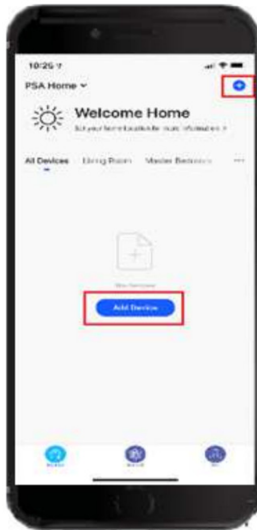
Figure 2. Add Device

c. In the left column, tap “Security”. Then tap the “IntelLink Floodlight Camera” icon. (Figure 3)