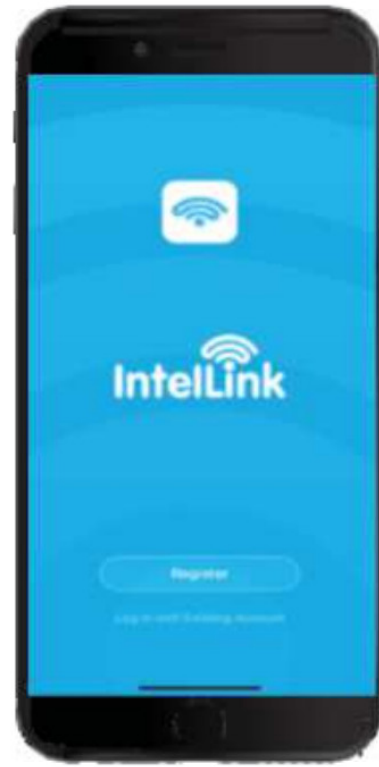
Figure 1. App Login & Registration