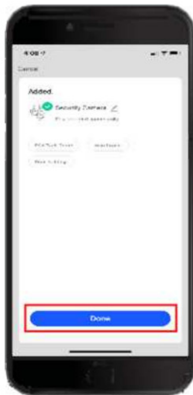
Figure 7. Success !

j. The App will report “Device added successfully”. Tap “Done” to acknowledge. (Figure 7)