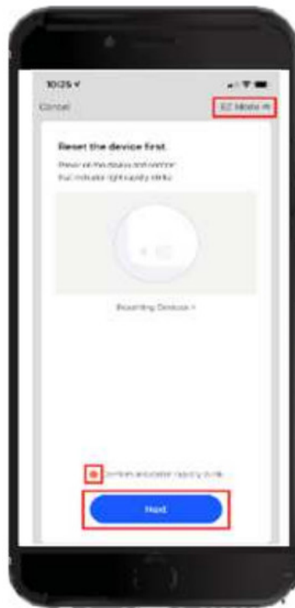
Figure 4. EZ Mode

e. Tap to “Confirm indicator rapidly blinking”