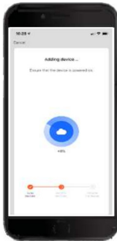
Figure 6. Pairing

j. The App will report “Device added successfully”. Tap “Done” to acknowledge. (Figure 7)