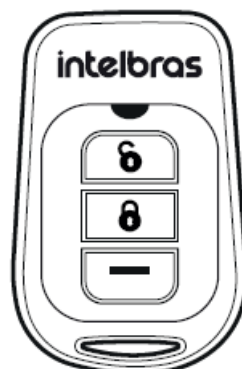
XAC 8000 remote control

To register the control with the alarm center, press the synchronization key on the center unit and then press any of the control keys to connect both and the LED should flash green, indicating the success of the registration. If the LED flashes orange, the signal is intermittent or weak and if the LED flashes red, there was some fault and the process must be repeated. The control addressing will be according to the sequence performed, respecting the maximum limit of 98 devices of this type.