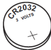
Battery model CR2032

The battery model should be CR2032, being used one (1) battery per control.