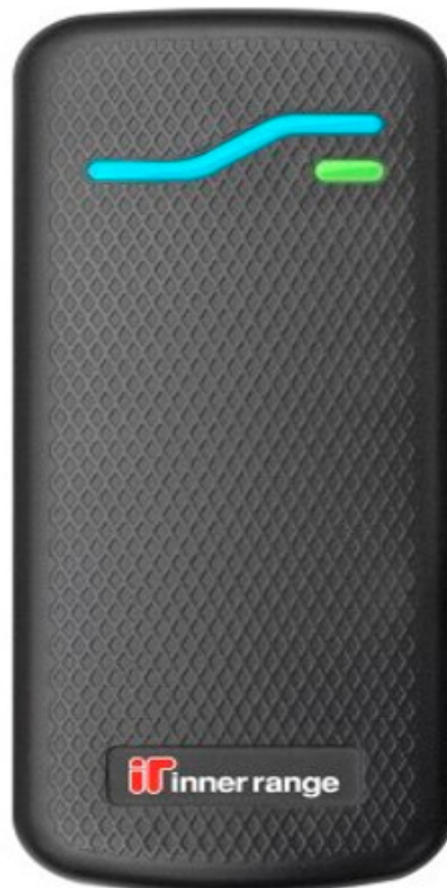
Inner Range SIFER Card Reader. Installation Manual.