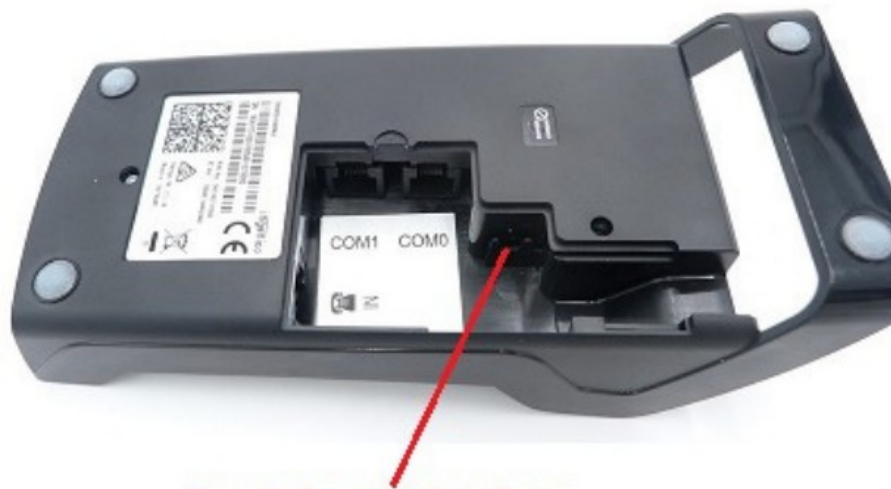
Power Connection Point

Please connect the Power Supply unit to mains power close to the desired location of the terminal. Connect the Power supply cable to the port shown.