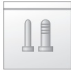
Screw Package ×1