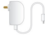
Power Adapter ×1