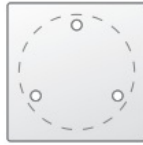
Positioning Map ×1