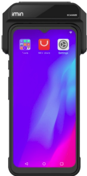
Swift 1s Pro