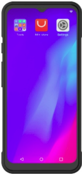
Swift 1 Pro