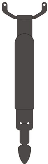
Swift 1 Strap (optional, default none)