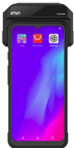
Swift 1s Pro (front)