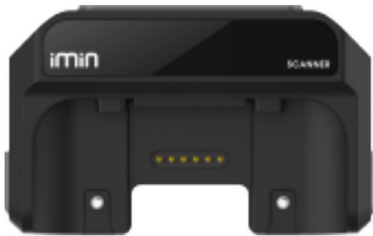
Swift 1 Scanner