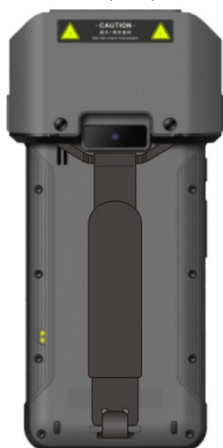
Swift 1s Pro (back)