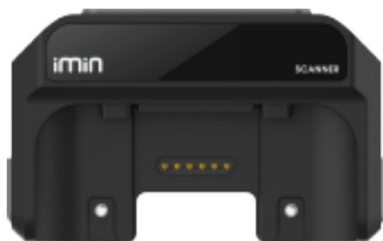
Swift 1 Scanner