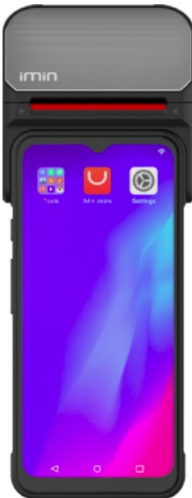
Swift 1p Pro