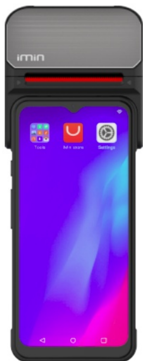
Swift 1p Pro