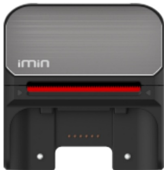
Swift 1 Printer