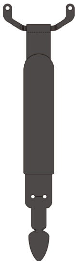
Swift 1 Strap