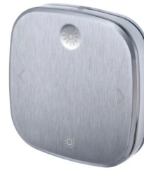
IKEA Styrbar Zigbee Remote