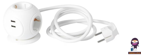
IKEA HAGSTA 3 Way Socket