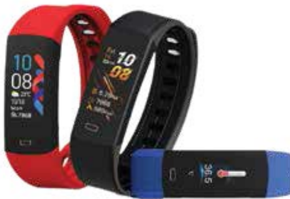
Model No.: iG-C6T