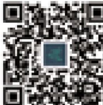
IOS for App Store