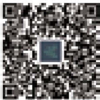
Android for Google Play

Step 2: To connect search for the name,'iGear Smartfit'.