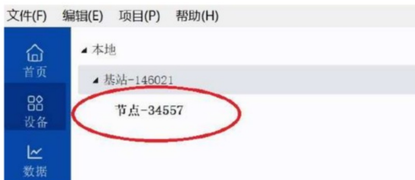
Figure 3 – Node Discovered On Same Frequency

If the base station and node are on the same operating frequency, the node will automatically appear below the base station list when the node is powered on.