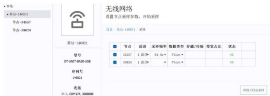
Figure 7 – Network Sampling

To start a sampling session, you can select nodes individually by selecting Node Name > Sampling, or select a group of nodes by selecting Base Stations > Sampling. As a group, they will all be set to the same sampling mode. After selecting a base station, all nodes will appear in the list with a check mark on the left, and all selected nodes will be included in the sample. Uncheck the nodes you want to exclude from sampling.