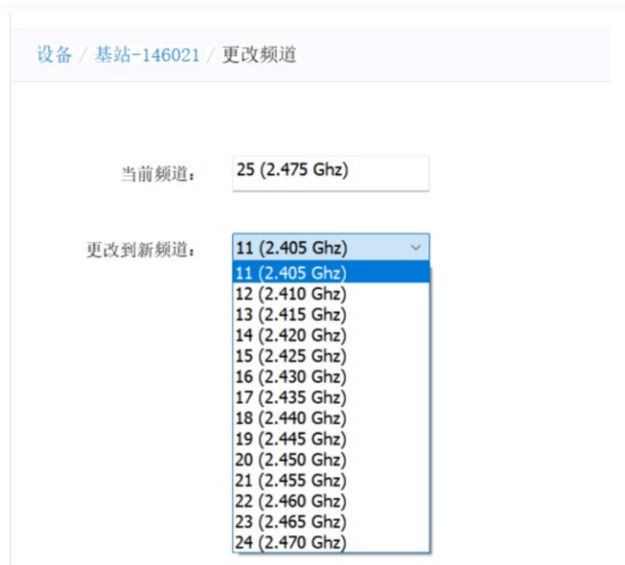
Figure 9 – Base Station Frequency

There are 16 channels available between 2.405 and 2.470 GHz. Wireless nodes and gateways must be on the same channel to communicate. To move a node to a different frequency, select the base station and then select the Change Frequency tile.