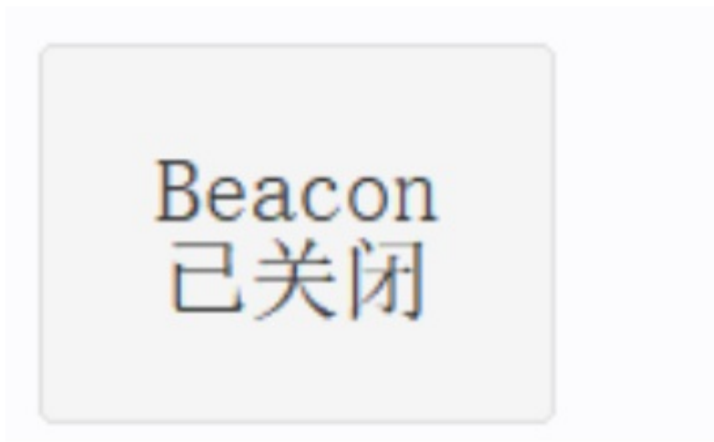
Figure 10 – Using the Beacon