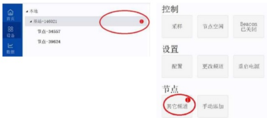
Figure 4 – Node On Other Frequency

Select a base station and then select the node tile on a different frequency. Tick the new node to be added and select “Apply” to move the node to frequency