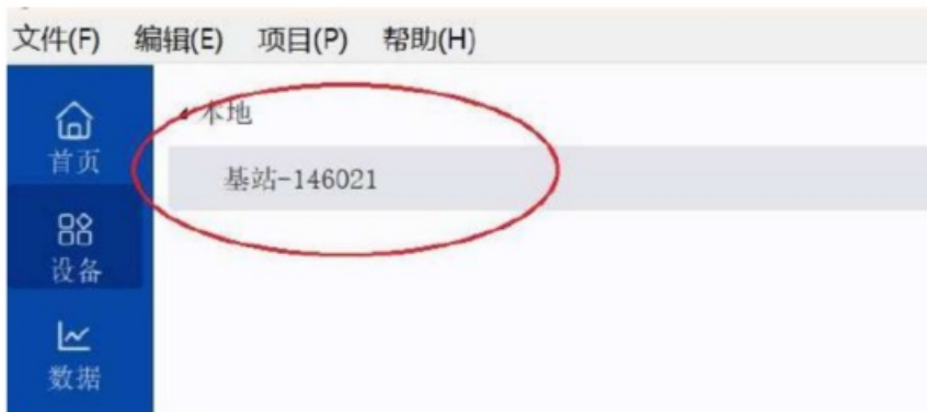
Figure 2 – USB Base Station Communication