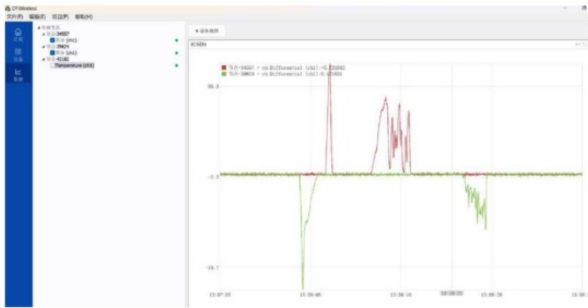
Figure 12 – Real time data monitor