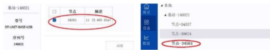
Figure 5 – Move Node

Select a base station and then select the node tile on a different frequency. Tick the new node to be added and select “Apply” to move the node to frequency