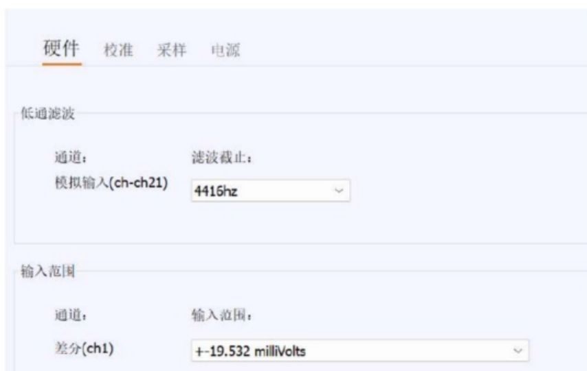
Figure 6 – Hardware Configuration Menu

Node settings are stored in non-volatile memory and can be configured using DT Wireless software. This chapter describes user-configurable settings.