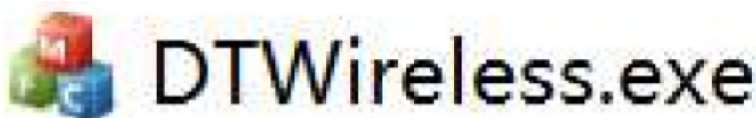
Figure 1 – DTWireless Software installation package

Before connecting any hardware, first install the host computer DT Wireless software on the host computer. To obtain the software installation package, please contact the relevant sales engineer or technical service engineer.