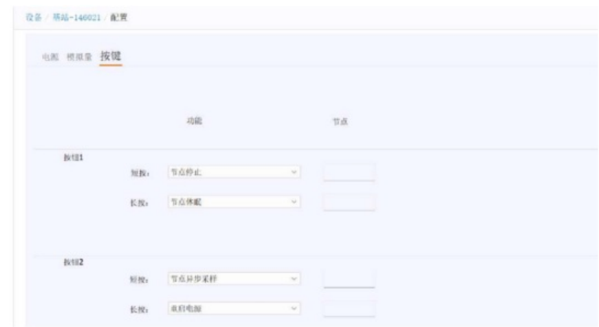
Figure 10 – Button configuration

The button function is mainly used to configure DT-UNIT-BASE-A. After leaving the software configuration, you can control the sampling, stop, sleep, restart and other functions of the node through the buttons.