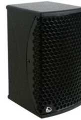
IDEA LUA5i Pro Audio