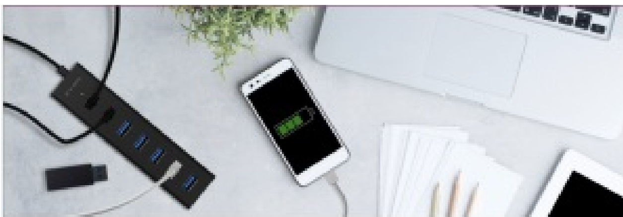
ICY BOX IB-HUB1700-U3 7-port USB 3.0 hub