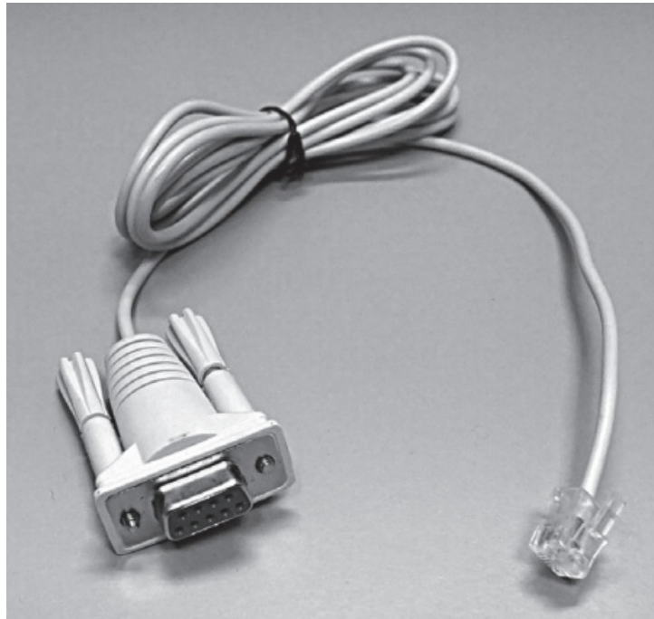
Figure 3. Orion GoTo telescopes and mounts come with a serial cable like this one that is needed to couple the StarSeek module to the mount for wireless telescope control from a mobile device.

the StarSeek module to the hand controller's serial port with an RS-232 serial cable — DB9 female to RJ11 male; most Orion GoTo telescopes and mounts come with this serial cable included ( Figure 3 ). Call Orion if you need to purchase a replacement cable.