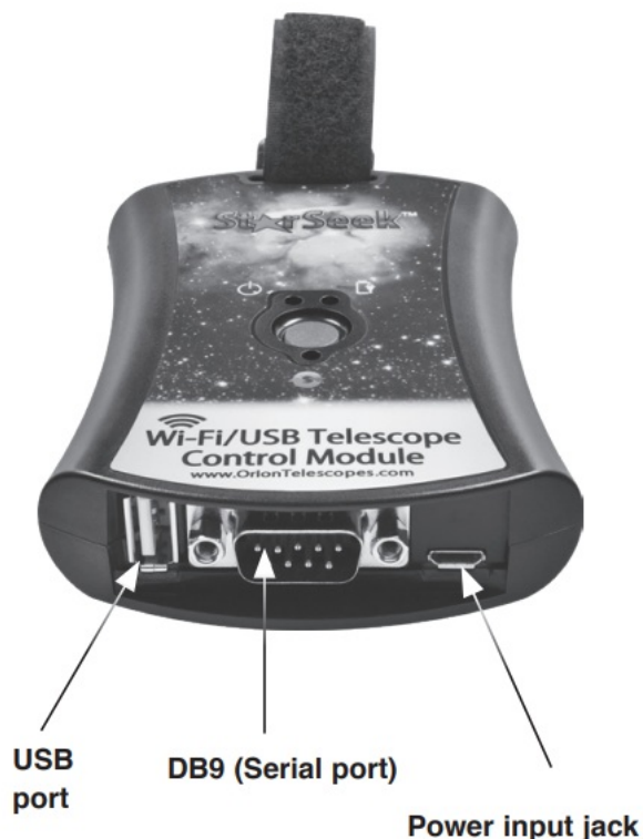
Figure 1. The USB and DB9 serial ports, and the power input jack (micro-USB) are on the bottom of the StarSeek module.

The StarSeek Wireless Telescope Controller module works with all Orion motor-driven GoTo telescopes, including the Atlas and Atlas Pro, Sirius and Sirius Pro, StarSeeker GoTo, and both SkyQuest XTg and XXg GoTo Dobsonian lines, as well as with many other GoTo telescope brands having RS-232 or USB ports. It also works with Orion IntelliScope “push to” scopes (requires #5222 IntelliScope to PC serial cable, sold separately).