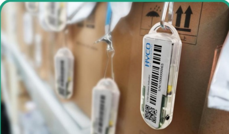
Delivery Service Station