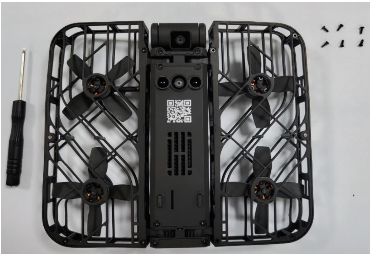
Disassembly Step 3 Remove the screw * 3 pcs