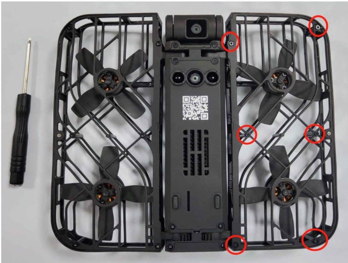
Disassembly Step 2 Remove the lower frame