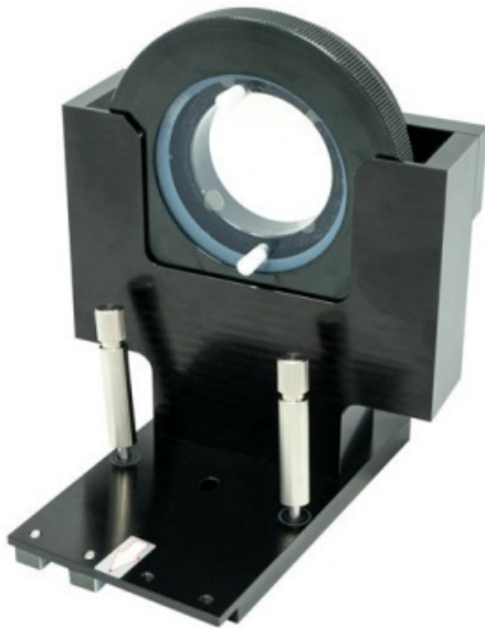
Figure 1. The HL Cell for the LA-960V2 analyzer.