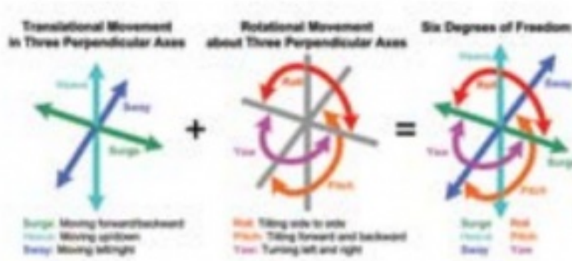
Figure 1. TARS Six Degrees of Freedom

In this example we can see that as the equipment begins to slip or spin the sensor detects movement and direction of that slippage, and signals from the sensor alerts the equipment control module. The system then can correct the equipment position in real-time, making it safer to operate, and reducing the possibility of equipment damage, potential landscape damage and potential operator injury.