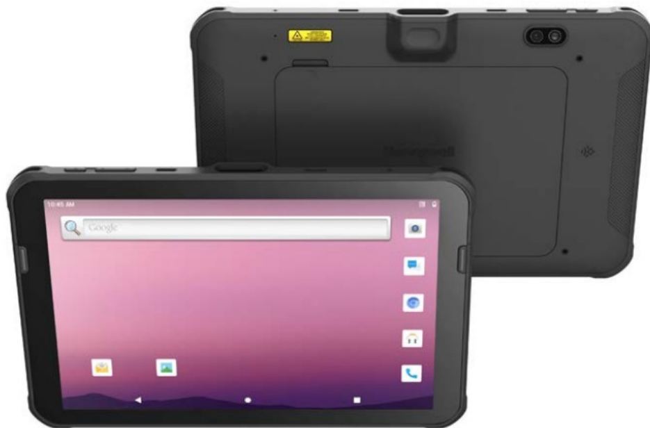
ScanPal™ EDA10A Accessories Guide