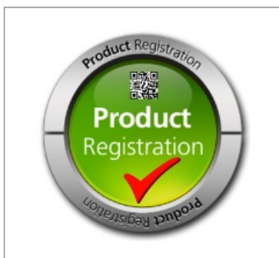
On-Line Product Registration

Under transport regulations, the UNIX V-lock Plate is factory-packed in a cardboard box with internal shock resistance protection. This kind of packaging makes travel and transportation safe for the Sea, Air, and Road.