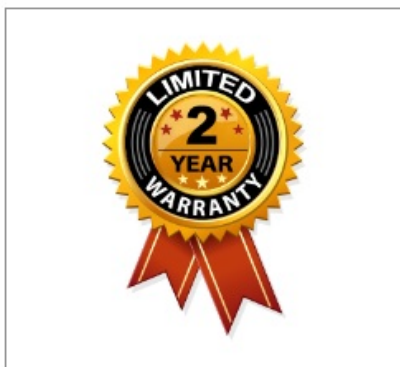
1 x 2 Year Limited Warranty