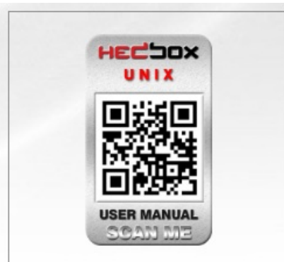
1x QR Code Card - User Manual