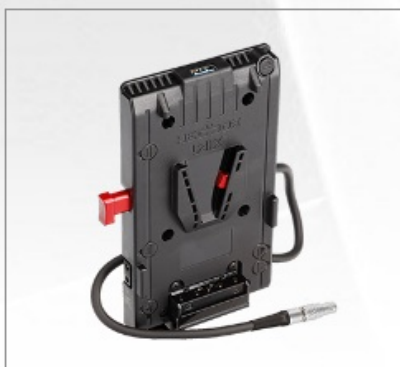
1 x UNIX-0B V-Mount Plate