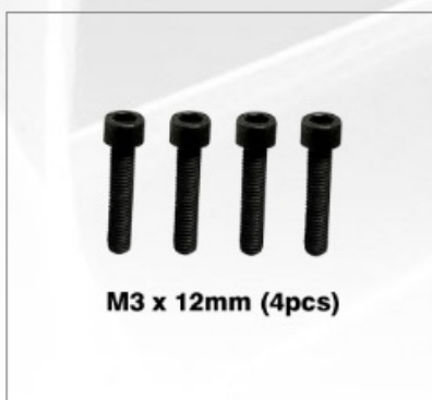
1 x Set Screw M3x12 ( 4pcs)