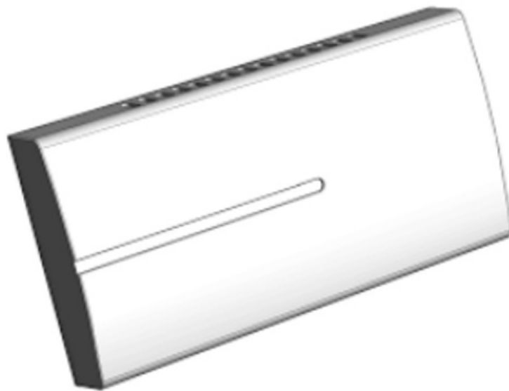
For Heat-Timer Wireless Product 050184-00