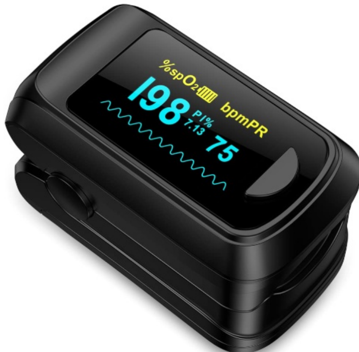
Instruction Manual Pulse Oximeter JKS50B

Please read the user manual carefully and keep it for future reference. If you need any further assistance, please contact us.