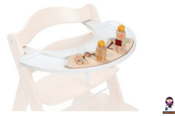
hauck Alpha Play Sorting Set