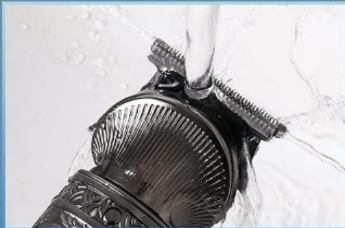
Washable blades for easy cleaning