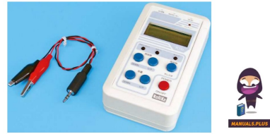
Handy Low Frequency Wave Oscillator