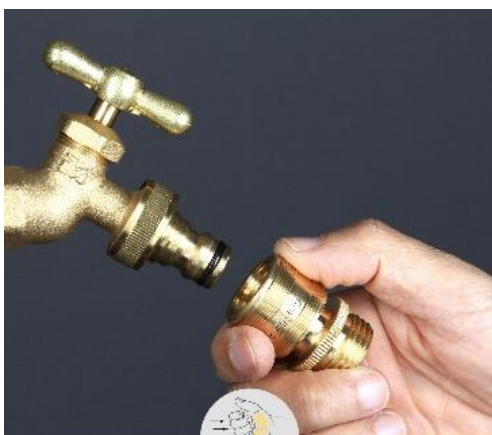
PULL TO REMOVE

3) Pull or push female part with collar pulled back to connect or disconnect.