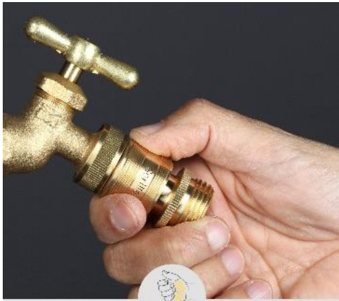
GRIP THE COLLAR

2) Screw threaded male end to hose or bib. Then pull back collar of female half to connect or disconnect.