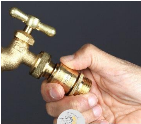
PULL BACK ON COLLAR

2) Screw threaded male end to hose or bib. Then pull back collar of female half to connect or disconnect.