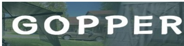
User Manual-Gopper RV Awning